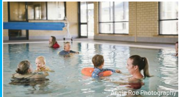
Angie Roe Photography