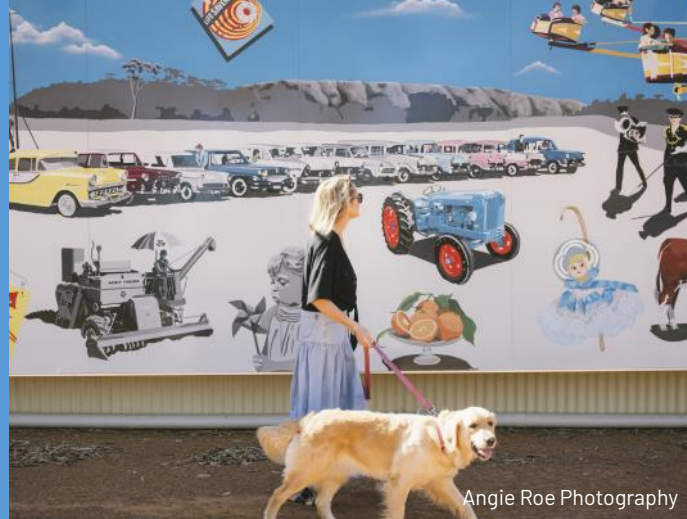
Angie Roe Photography