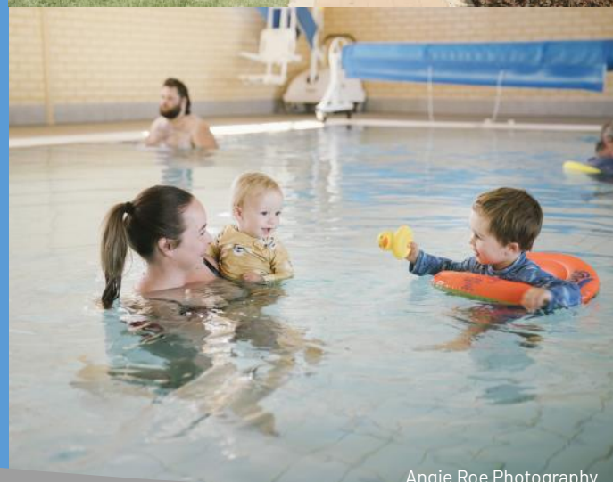
Angie Roe Photography