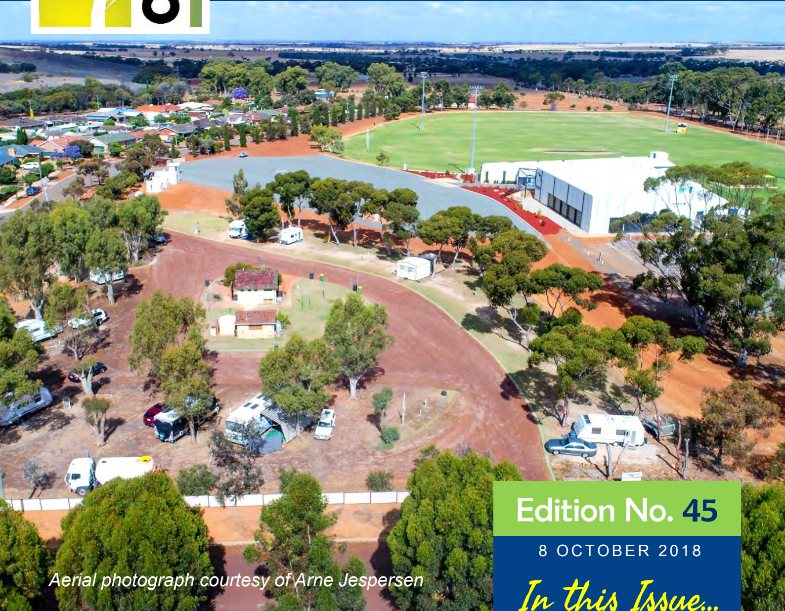
Aerial photograph courtesy of Arne Jespersen

Keeping the Corrigin community informed and involved