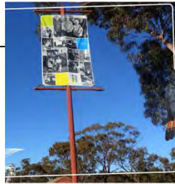
Project: Staying@Home: Community photography project