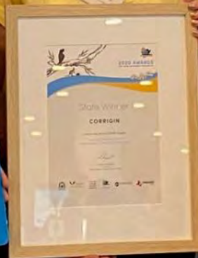
Tidy Towns Sustainable Award Winners - 2020 Community Action

STATE CATEGORY WINNER 2020 Community Action