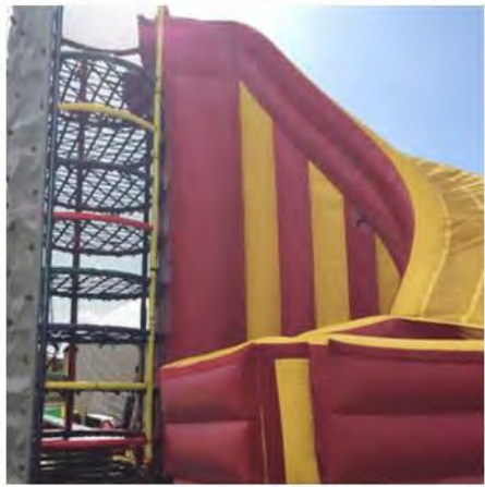
SPIDER MOUNTAIN WITH SLIDE