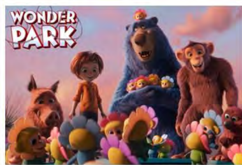
OUTDOOR MOVIE - WONDERPARK