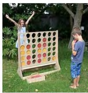
GIANT CONNECT 4