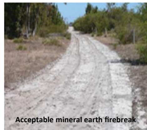
Acceptable mineral earth firebreak

The term " mineral earth firebreak " means an area of the owner(s)/occupiers(s) land, cleared and maintained totally clear of all vegetation material (living or dead) so there is only mineral earth left.