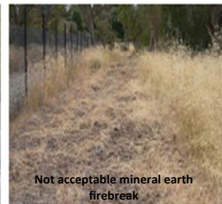
Not acceptable mineral earth firebreak

PLEASE PLAN AHEAD, do not ring a Fire Control Officer on the day you want to burn and expect a permit, as it may not be granted. You must give notice to your neighbours and the Shire once the permit is granted.